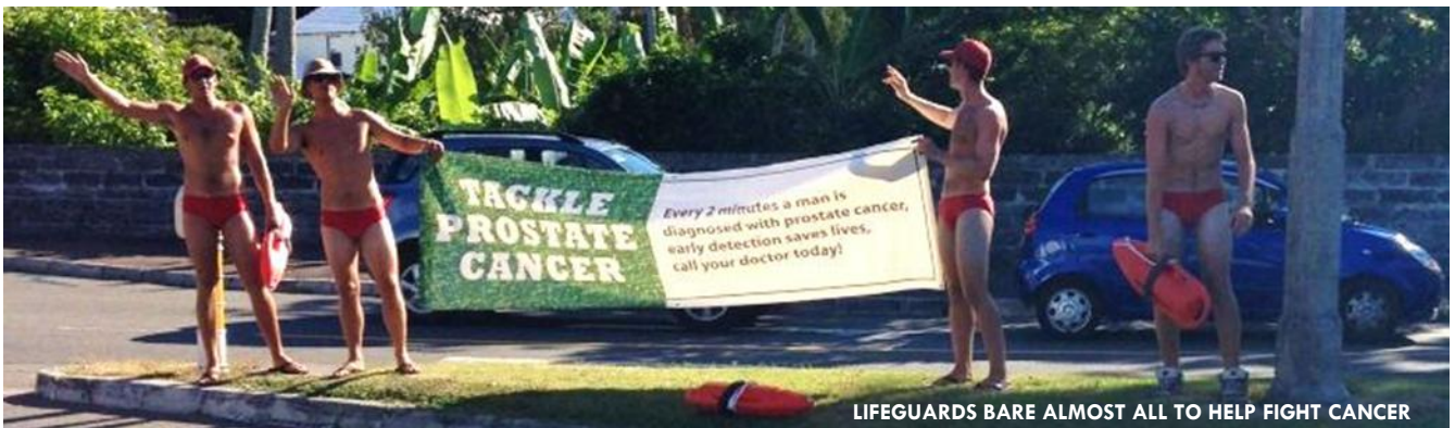
LIFEGUARDS BARE ALMOST ALL TO HELP FIGHT CANCER