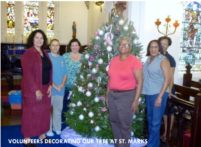
VOLUNTEERS DECORATING OUR TREE AT ST. MARKS