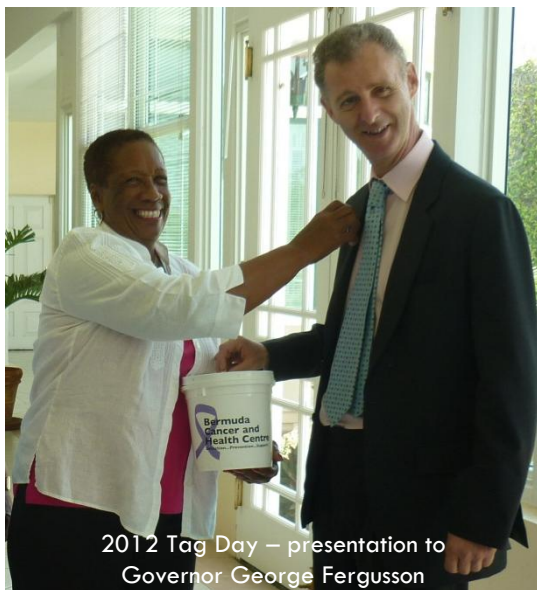
2012 Tag Day – presentation to Governor George Fergusson

With the support of our new sponsor Elbow Beach Bermuda, over $133,000 was raised by the 156 participants in Movember to support our Men’s Health Programme, which encourages men over the age of 40 to take control of their health. Funding was provided to 166 uninsured/underinsured men to assist with costs of receiving an annual physical. A free men’s screening clinic was offered in January giving men access to critical screening tests and the opportunity for brief consultation with a local physician.