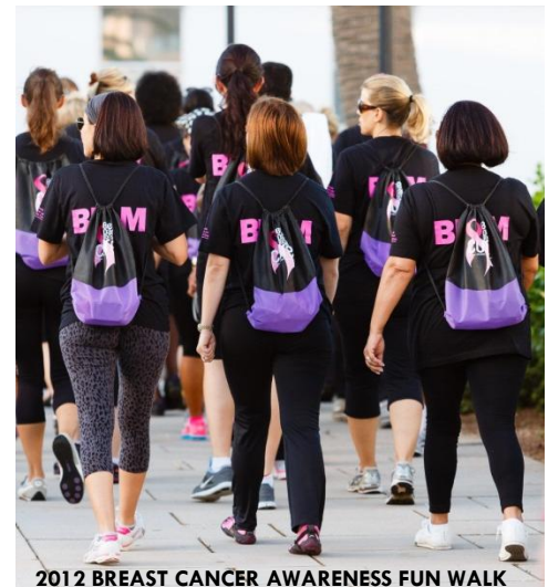
2012 BREAST CANCER AWARENESS FUN WALK