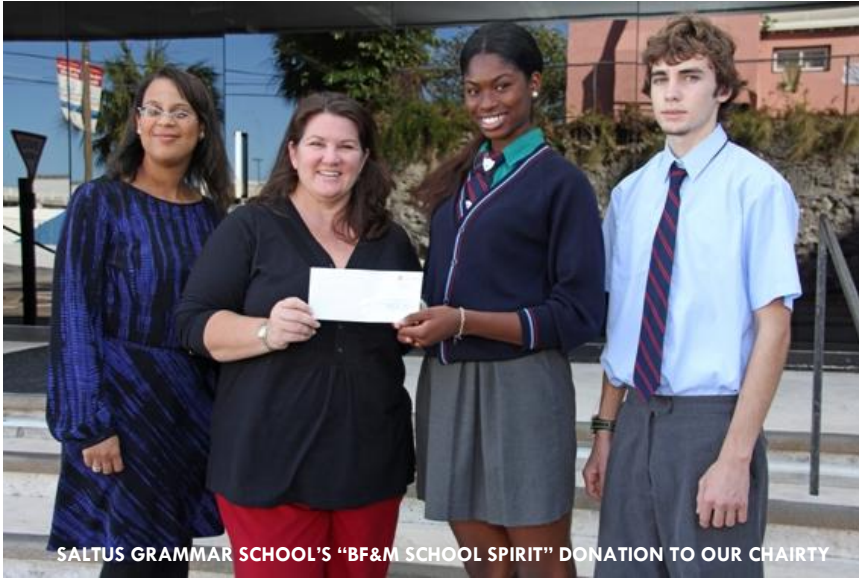
SALTUS GRAMMAR SCHOOL'S "BF&M SCHOOL SPIRIT" DONATION TO OUR CHARITY