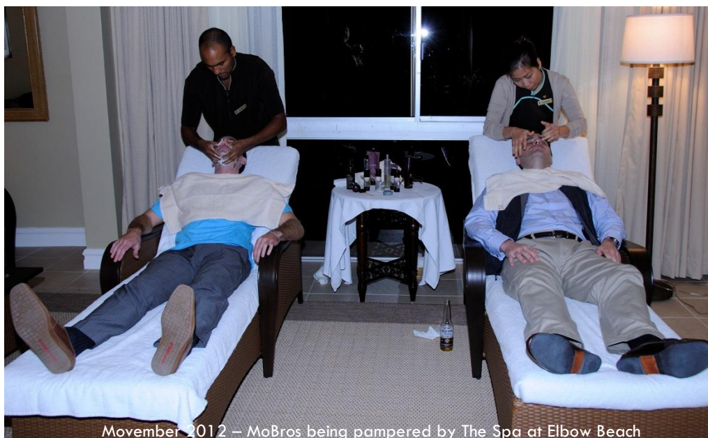
November 2012 – MoBros being pampered by The Spa at Elbow Beach

An audit of vendors was performed, and reliable vendors have been retained to ensure dependable delivery and competitive pricing from which the Centre has greatly benefited.