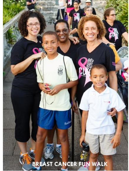
BREAST CANCER FUN WALK