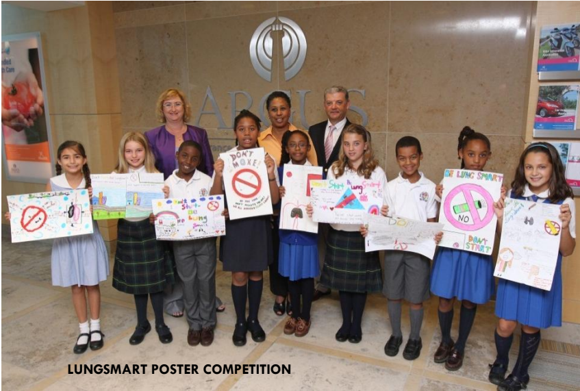
LUNGSMART POSTER COMPETITION