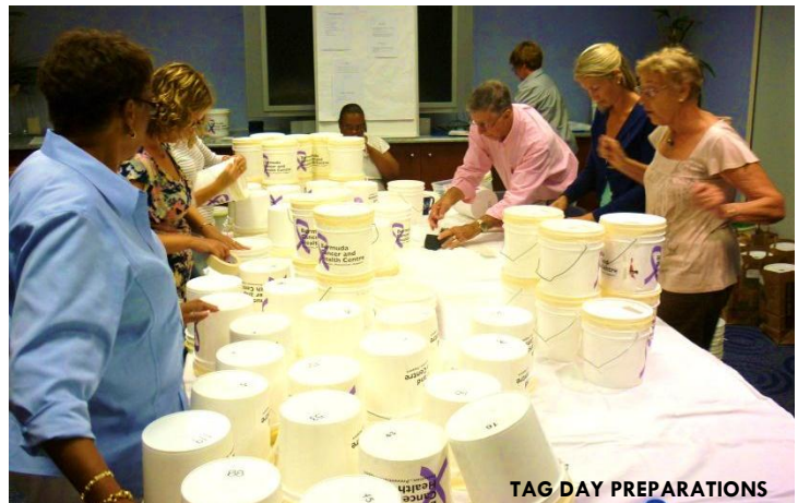
TAG DAY PREPARATIONS