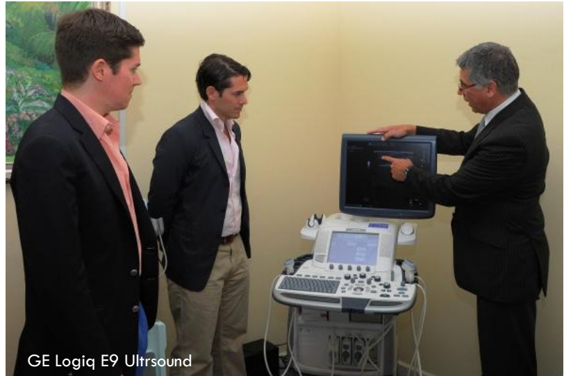
GE Logiq E9 Ultrasound