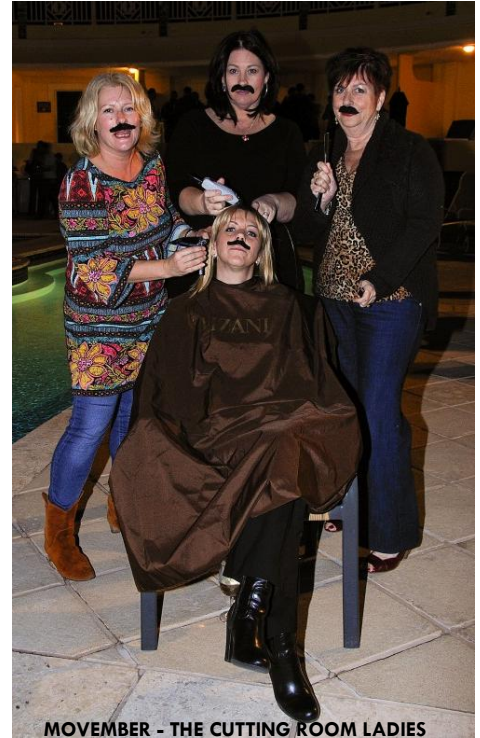
NOVEMBER - THE CUTTING ROOM LADIES