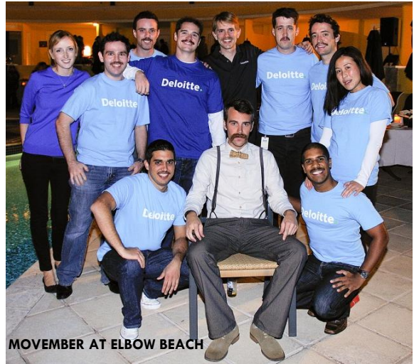
MOVEMBER AT ELBOW BEACH