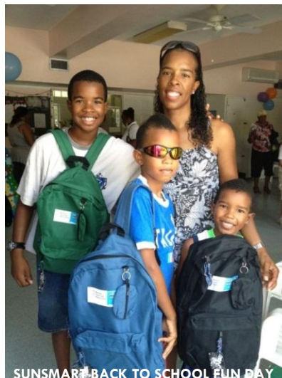
SUNSMART BACK TO SCHOOL FUN DAY