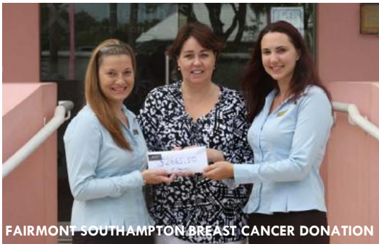
FAIRMONT SOUTHAMPTON BREAST CANCER DONATION