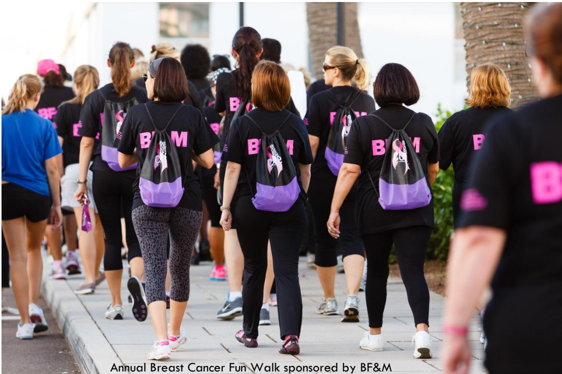
Annual Breast Cancer Fun Walk sponsored by BF&M

Eleven new servers along with upgraded software were acquired in 2012 at a cost of $157,620. These systems process and store the Centre's digital images and include a "real-time" backup server which is hosted off-site. The system upgrade included a new CD/DVD burner which enables the Centre to provide digital imaging on CD's or DVD's to patients, physicians and other imaging facilities. The PACS system has also been integrated with our new RIS System which provides the Centre's Breast Specialist Radiologist with streamlined functionality.