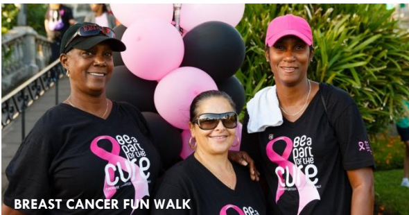
BREAST CANCER FUN WALK